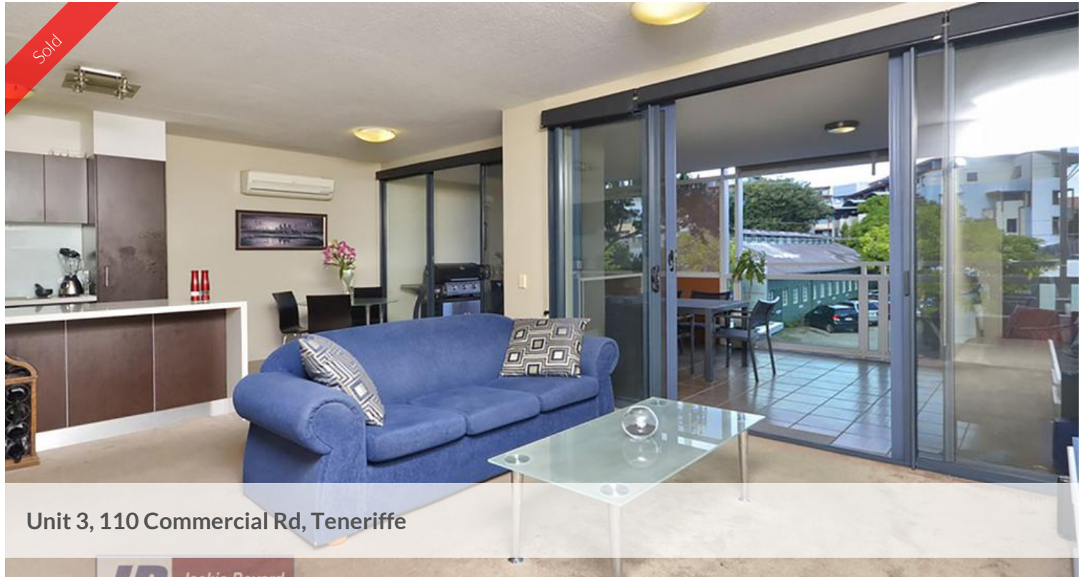
Unit 3, 110 Commercial Rd, Teneriffe