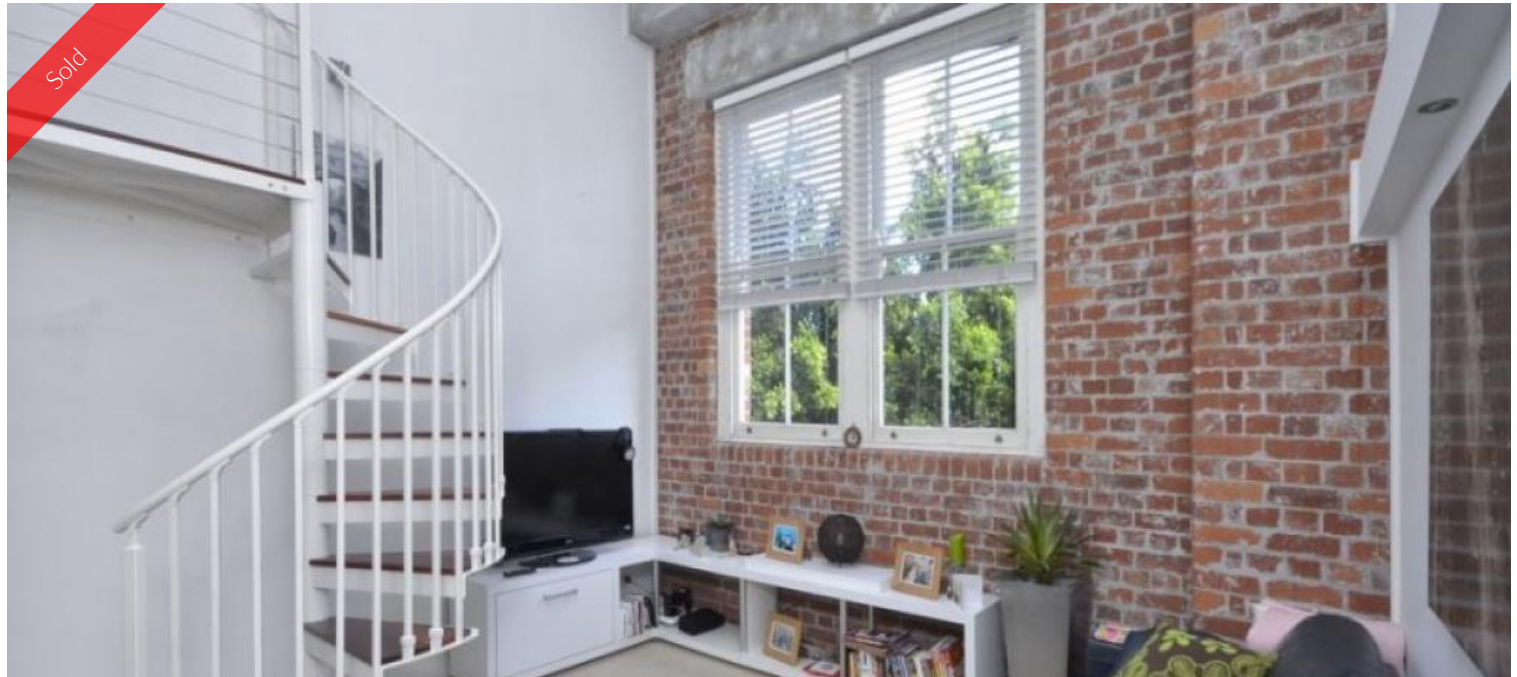
53 Vernon Terrace, Teneriffe