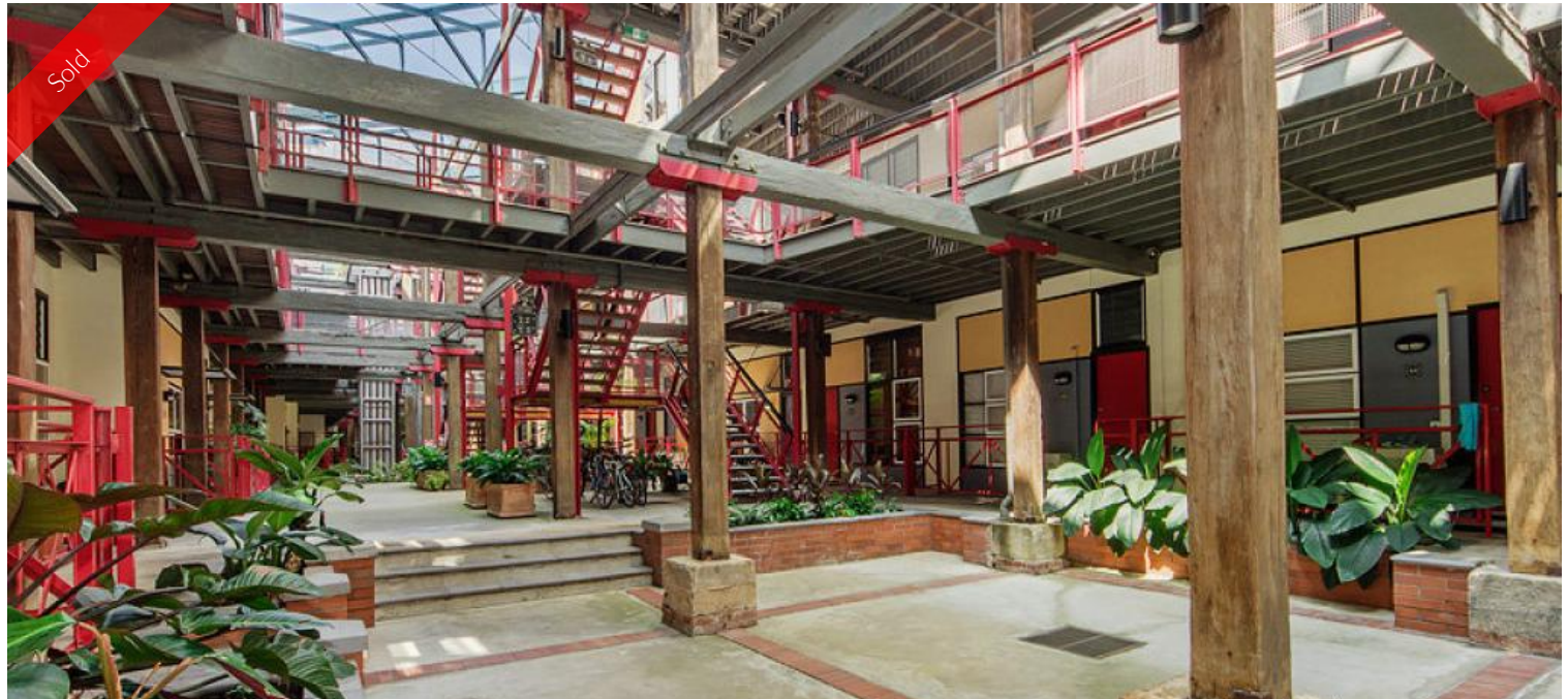
53 Vernon Terrace, Teneriffe