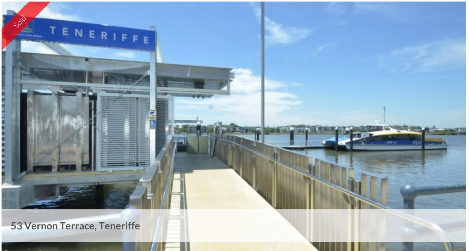
53 Vernon Terrace, Teneriffe