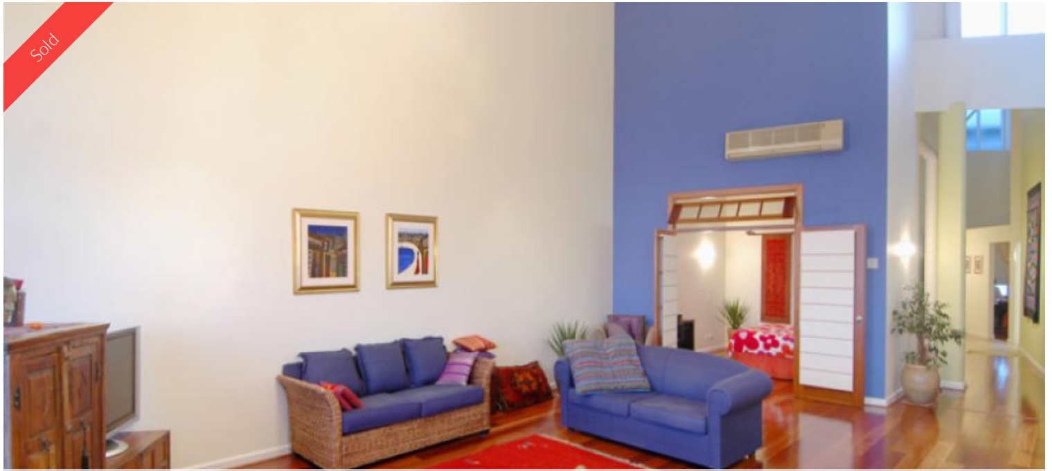
110 Macquarie Street, Teneriffe