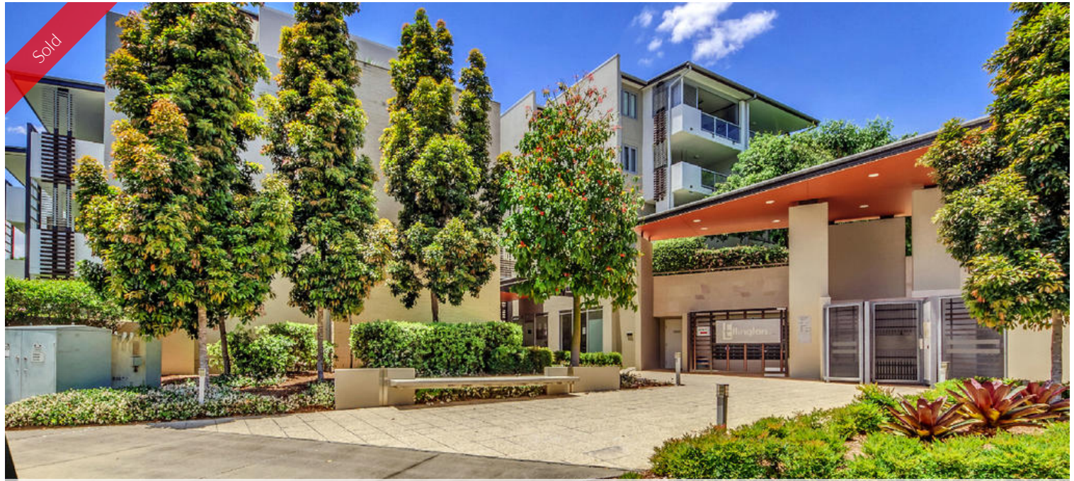
Unit 264, 71 Beeston St, Teneriffe